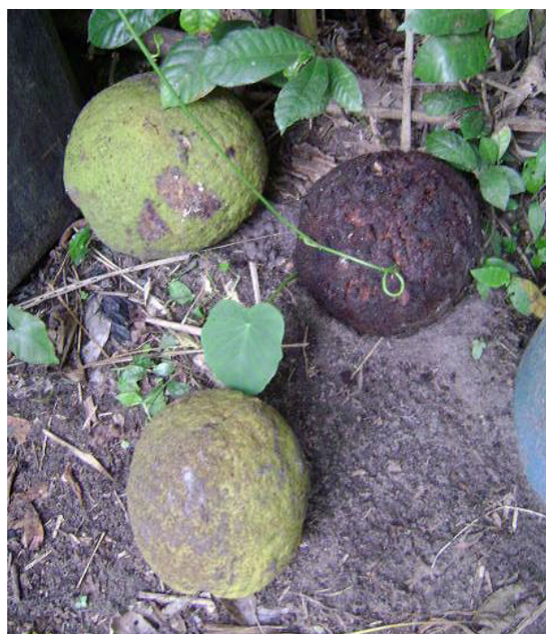
Fig. 1a. Treculia africana fruits

The pictorial presentations of the Treculia africana fruits and the dehulled seeds that were used for this study are shown in Figures 1a and 1b. The result of