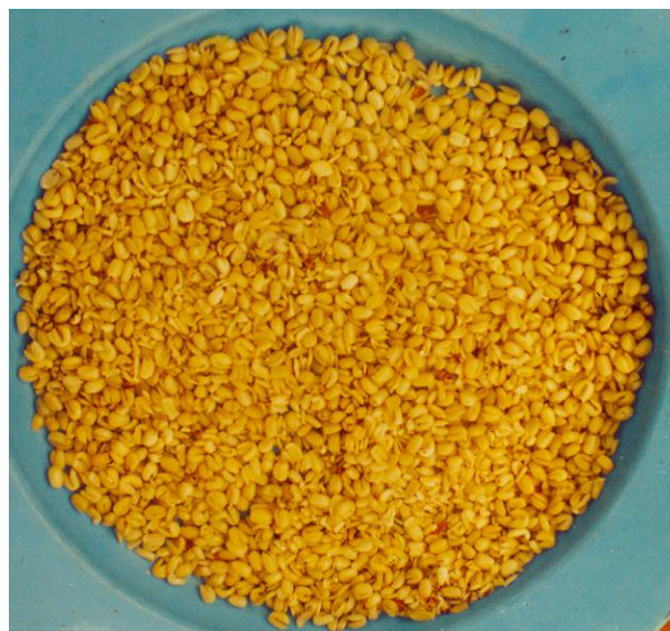
Fig. 1b. Dehulled Treculia africana seeds

the serum glucose levels of the rats investigated in this study is presented in Table 1. The glucose levels of the diabetic control rats were significantly increased