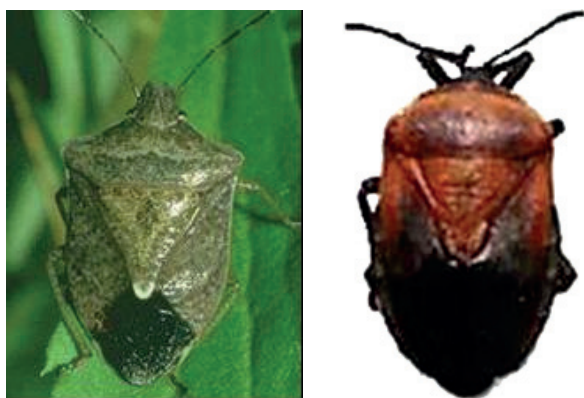
Fig. 1. Sorghum bug adult (left) and melon bug adult (right) [Abdelfadeel 2012]

Gelatin can be made from many different sources of collagen. Cattle bones, hides, pig skins, and fish are the principle commercial sources. As such, it may come from either agricultural or non-agricultural sources. There are no plant sources of gelatin, and there is no chemical relationship between gelatin and other materials referred to as vegetable gelatin, such as seaweed extracts [GMIA 2012]. Mariod et al. [2011 b] prepared and characterised edible Halal gelatins from two Sudanese edible insects that are melon and sorghum bugs (Fig. 1).