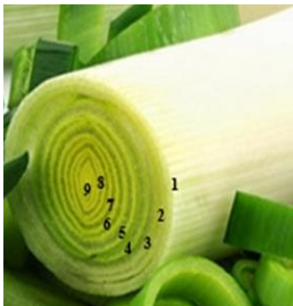
Fig. 1. The layers of a leek

Leek ( Allium porrum ) samples were purchased from a local market in Konya, Turkey. The layers were numbered from the outermost to the innermost part, with the outermost layer coded as 1, and the innermost as 9 (Fig. 1).