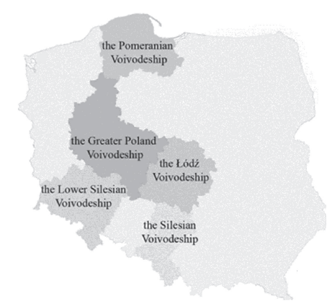
Fig. 1. General locations of areas (regions) of mushroom sample collection

Mleczek M., Siwulski M., Kaczmarek Z., Rissmann I., Goliński P., Sobieralski K., Magdziak Z., 2013. Nutritional elements and aluminium accumulation in Xerocomus badius mushrooms. Acta Sci. Pol., Technol. Aliment. 12(4), 411-420.