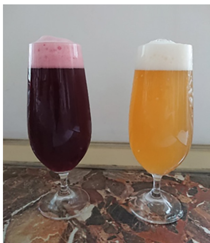
Fig. 1. Beer with bilberries added on the seventh day of maturation (on the left) and control beer (on the right)

main phenolic acid found in blueberries ( Vaccinium corymbosum L.) and bilberries ( Vaccinium myrtillus L.). Su et al. (2017) reported the presence of vanillic, ferulic, caffeic, gallic, and 3,4-dihydrobenzoic acids. Caffeic, ferulic, and p-coumaric acids were identified in bilberries analysed by Može et al. (2011).